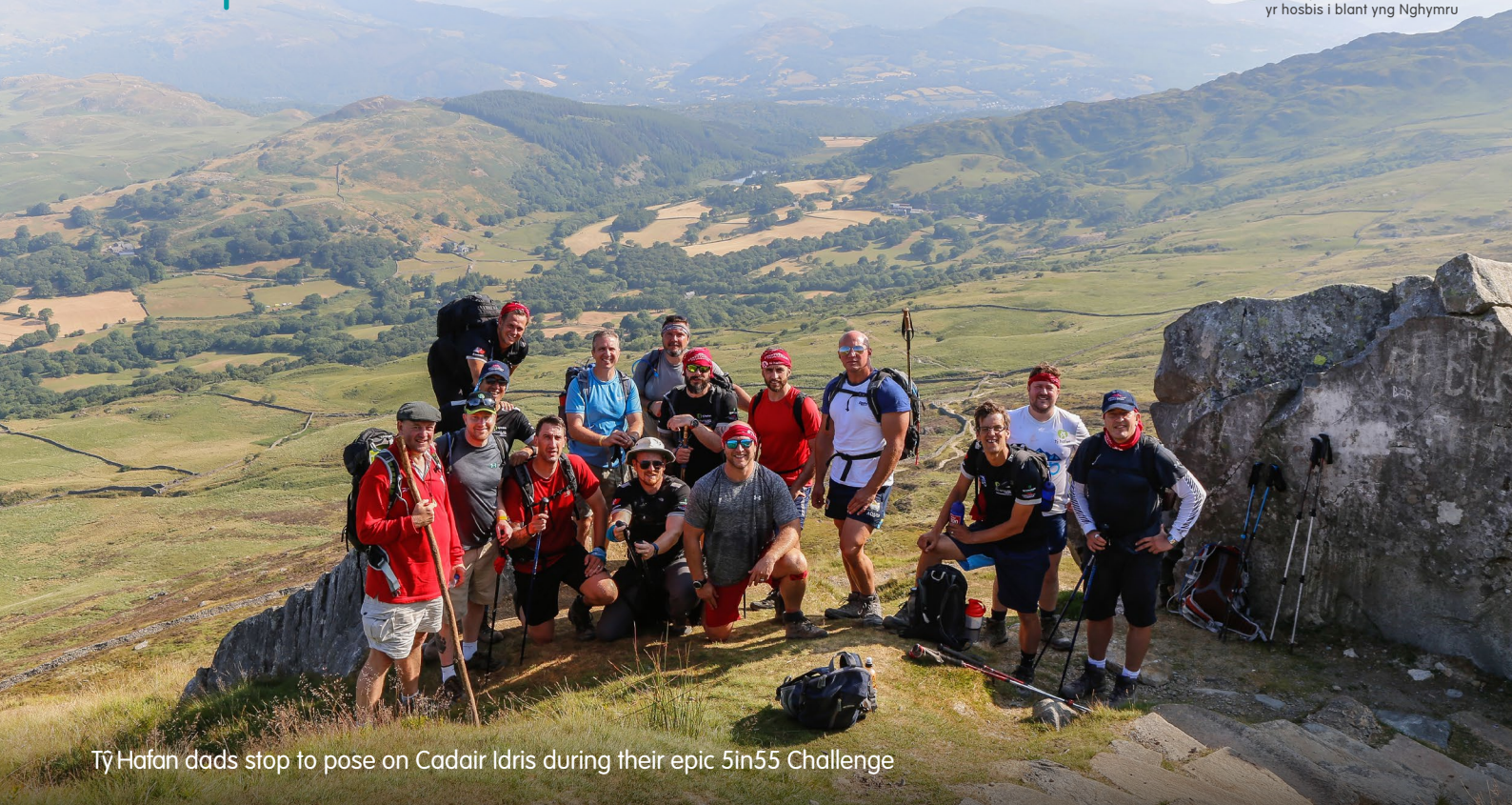
Tŷ Hafan dads stop to pose on Cadair Idris during their epic 5in55 Challenge

the hospice for children in Wales yr hosbis i blant yng Nghymru